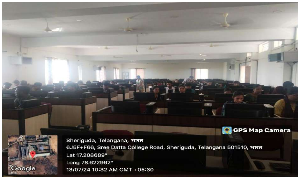
COMPUTER LAB 110-B BLOCK