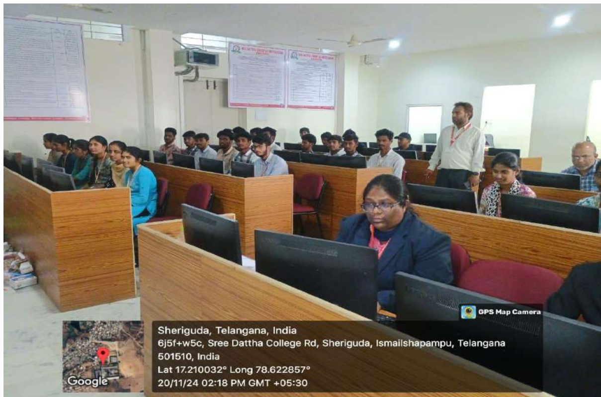
COMPUTER LAB 104-B BLOCK