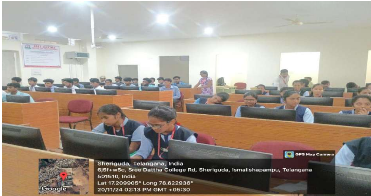
COMPUTER LAB 016-B BLOCK