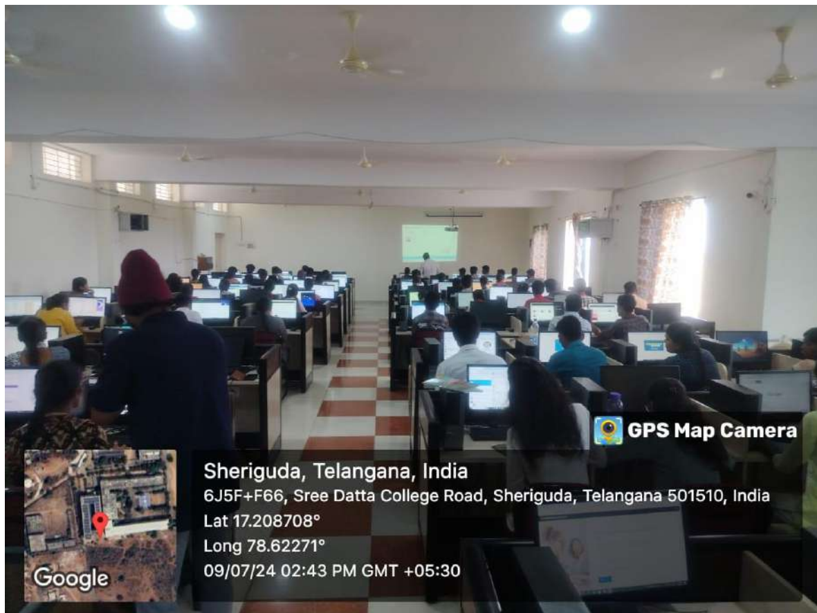
COMPUTER LAB 208-B BLOCK