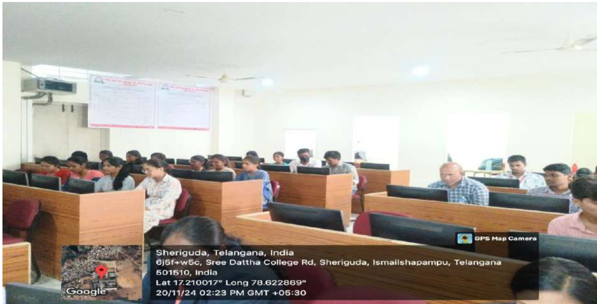
COMPUTER LAB 113- B BLOCK