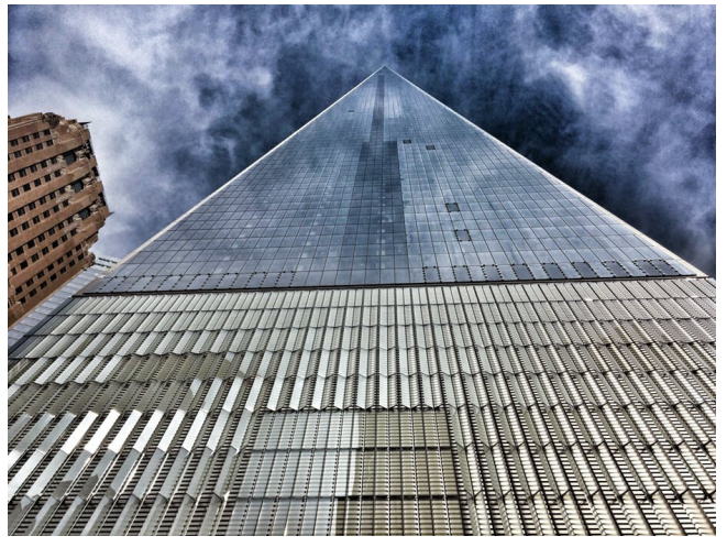
THE NEW ONE WORLD TRADE CENTER BUILDING, MADE WITH HIGH-PERFORMANCE CONCRETE

The materials that buildings are made of also matter. The steel columns in the World Trade Center towers lost strength rapidly when the fire reached 400 degrees Fahrenheit. Concrete heated to that temperature, though, doesn't undergo significant physical or chemical changes; it maintains most of its mechanical properties. In other words, concrete is virtually fireproof. The new One World Trade Center building takes advantage of this. At its core are massive three-foot-thick reinforced concrete walls that run the full height of the building. In addition to containing large amounts of specially designed reinforcing bars, these walls are made of high-strength concrete.