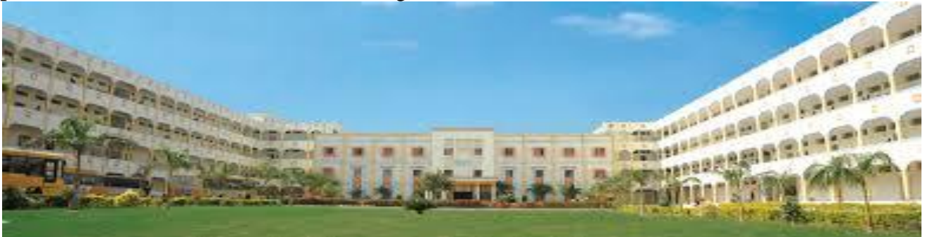
SREE DATTHA INSTITUTE OF ENGINEERING AND SCIENCE SHERIGUDA, IBRAHIMPATNAM, HYD

Dept Mission 4: Collaborate to meet the challenges and betterment of the mankind.