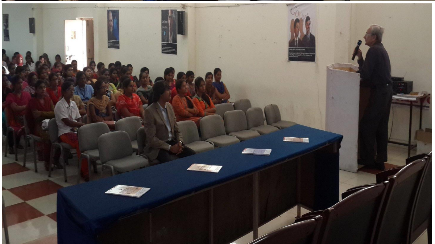
Chairman and Managing Director of “Bharath Dynamics Limited (BDL)” spent half a day with faculty of Sree Dattha Institutions on 20th April 2016.