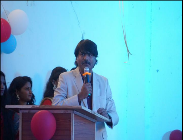
Director sir interacting with the Fresher's Day students