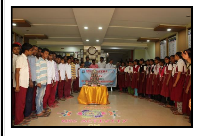
NSS activity inauguration by CSE