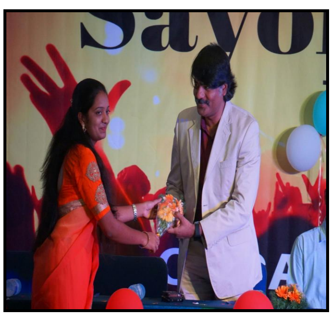
ECE student presenting bouquet to Director Sir