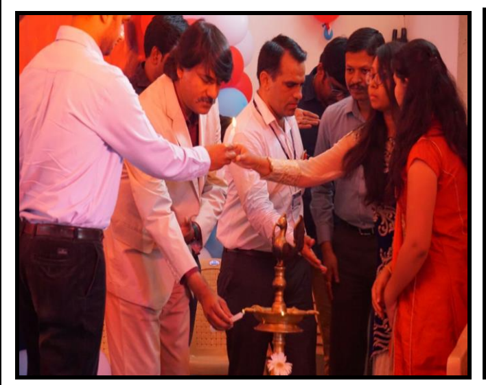
Fresher's Day Lightening ceremony