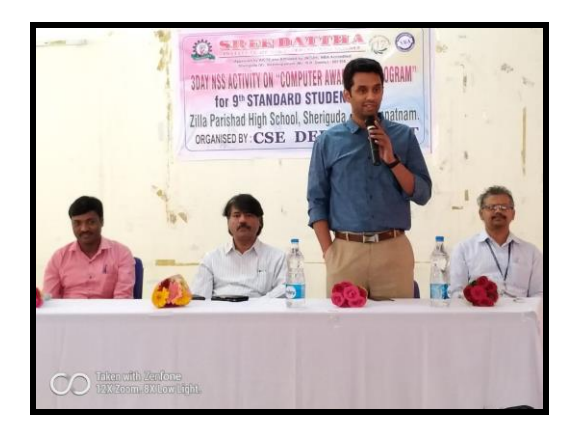
Speech by vibhav sir on NSS activity