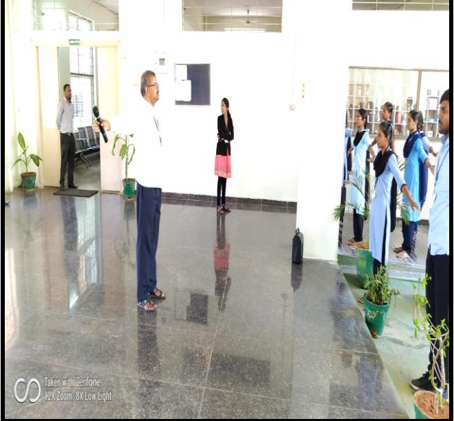
students doing tha Asanas during the Yoga day